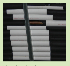
Not allowing for expansion or contraction to occur on variable temperature pipes resulting in movement causing saddles to shift and insulation to tear.