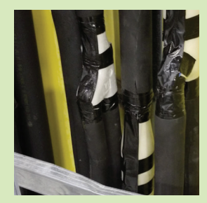
Failure to provide proper spacing between pipes causing thermal loss, condensation, and complete renovation of pipe system.