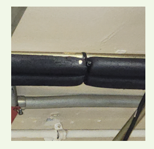
Gouging insulation with cable ties, tape, or tie wire causing a thermal break, damage, and deterioration.