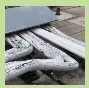
Failure to protect insulation from outdoor weathering and UV radiation causing exposed pipes, degrading of material and thermal loss.