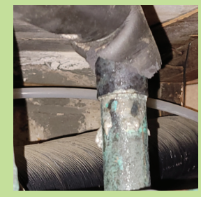
Moisture, contaminants, and dissimilar metals causing corrosion, system failure and refrigerant leaks which release greenhouse gas emissions 100x greater than CO2.