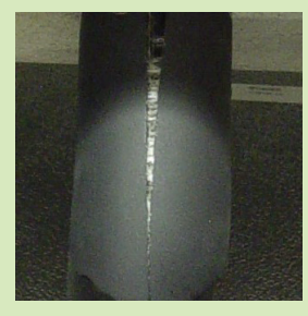
Failure to establish a vapor barrier at termination points by using too much adhesive or not letting adhesive tack long enough to cure.