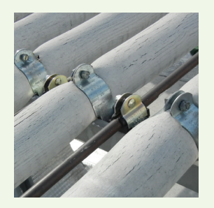
Compressing insulation with clamps causing thermal loss, damage, and condensation.