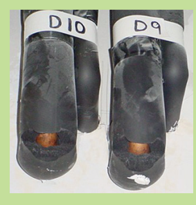
Stretching insulation over a 90 degree fitting causing tearing and pipe exposure.