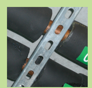
Incorrect pipe supports used such as a steel struts, not insulating at the fixed points, or not using any pipe support system, causing galvanic corrosion, thermal loss, and condensation.