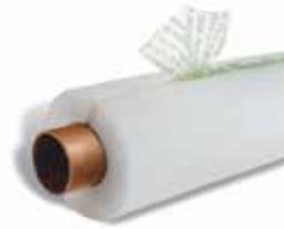
Tundra W SS