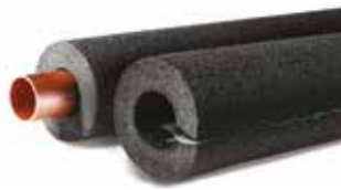
Tundra and Tundra SS